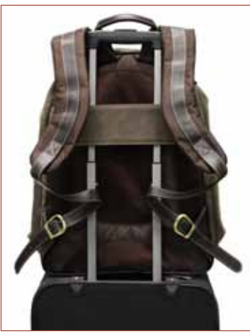
The back panel has a webbing strap to fit securely over a luggage handle